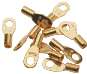
111411 / Ring Terminal