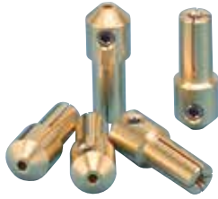
110102 / Push-On Connector

In-Line Connectors are available to accept a range of standard pin sizes. They are constructed of UHV compatible gold-plated beryllium-copper material, and the two included screws are stainless steel.