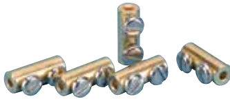
110111 / In-Line Connector