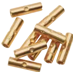
111421 / Butt Terminal