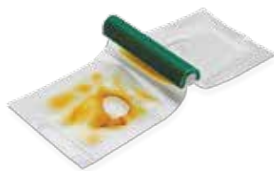
111785 / Hi Temperature Epoxy 250°C (400°C Intermittent)