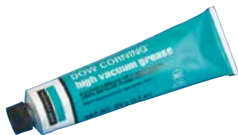
110505 / Dow Corning High Vacuum Grease