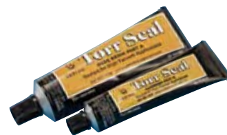
110516 / Torr-Seal®