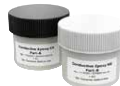
113255 / Conductive Glue H21D 150°C