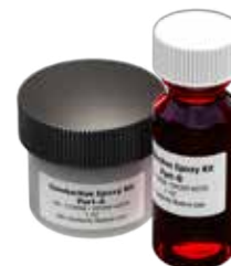
113256 / Conductive Glue H27D 270°C