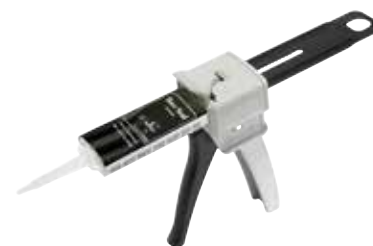
113257 / Epoxy Mixing System