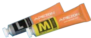
110506, 110507 / Apiezon® Vacuum Grease L / M Types