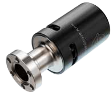
113145 / PRV mounted on 1.33 CF Flange