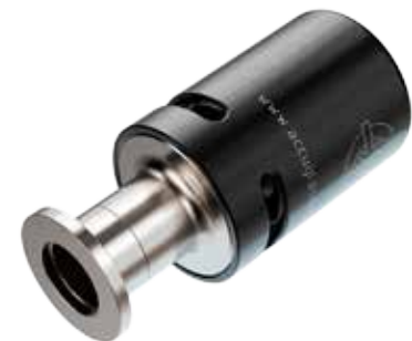
113155 / PRV mounted on NW16 ISO Flange