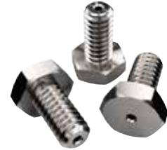
210388 / Hex Head 1/4-20 Vented Screw