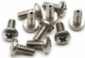
210300 / Phillips Pan Head #4-40 Vented Screw

The use of 'Vented' fasteners inside a vacuum environment is critical. A non-vented, blind-threaded hole creates a gas pocket that's difficult or impossible to evacuate (pump down) without an escape path. A trapped gas will manifest itself as a 'virtual leak', which is difficult to locate and causes unwanted downtime. Accu-Glass vented fasteners are manufactured from vacuum compatible 18-8 grade stainless steel.