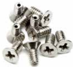
210306 / Phillips Flat Head #4-40 Vented Screw