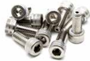
210027 / Socket Head Cap #10-32 Vented Screws