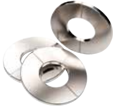
210405 / Flat Washer 1/4 Inch Vented

The use of 'Vented' fasteners inside a vacuum environment is critical. A non-vented, blind-threaded hole creates a gas pocket that's difficult or impossible to evacuate (pump down) without an escape path. A trapped gas will manifest it self as a 'virtual leak', which is difficult to locate and causes unwanted downtime. Accu-Glass vented fasteners are manufactured from vacuum compatible 18-8 grade stainless steel.