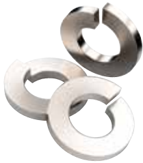
210414 / Lock Washer 1/4 Inch Vented