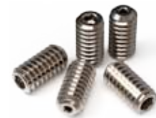
210446 / Socket Set Screw 1/4-20 Vented Set Screw